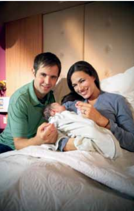
New, larger maternity rooms at St. Vincent Carmel Hospital welcome all family members in the celebration of life.

"These initiatives, along with our community outreach programs such as health screenings,