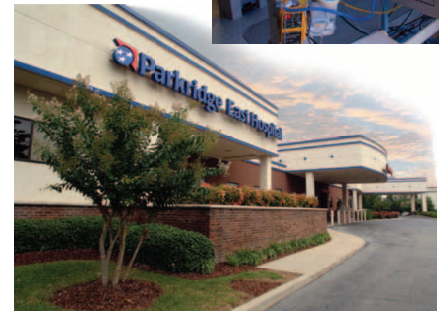
◀ Parkridge East Hospital, a facility of Parkridge Medical Center, is well known as a leader in obstetrics, high-risk births and women's services, but also specializes in orthopaedics, emergency care, inpatient & outpatient surgery and diagnostics.

▼ With a reputation for advanced technology and compassionate care, Parkridge Medical Center has served the community for nearly 40 years. Parkridge was recently named a Blue Distinction Center for Hips and Knee Replacement by Blue Cross Blue Shield based on our clinical outcomes and processes.